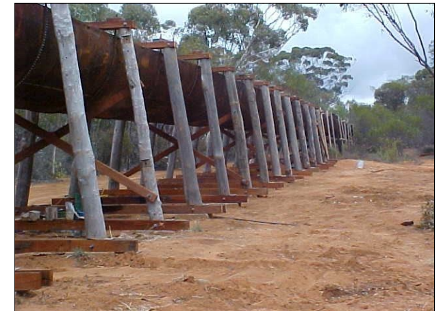
Flume at Karalee Dam