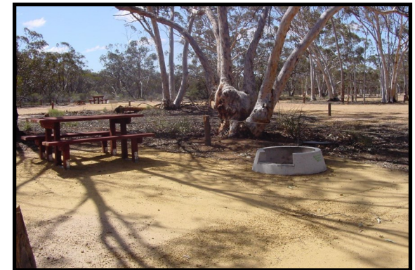
Karalee Dam picnic site

A walk over the rock enables the viewer to take in the terrain and vastness of the area with the view to Mt Clara, 2kms to the north and Hermit Rock. It is said that a hermit, a Swedish man, made his home here, he excavated a small dam in the granite, grew fruit, vegetables and cereal crops for his own use and on occasion would load his wheelbarrow and walk the 40 miles to Southern Cross to trade for other necessities. He, like so many others, just walked away.