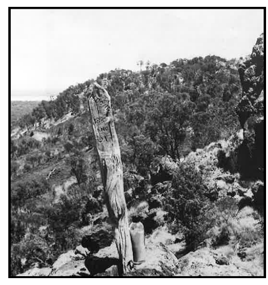
Dowd's peg and cairn near the top of Dowd's Hill

Iron Ore recommenced in 1993/94. By Portland Mining Venture—Koolyanobbing Iron, and the ore is now railed to Esperance 578kms to the south. During 1994/95, 714025 tonnes of Ore for $14 million was produced.