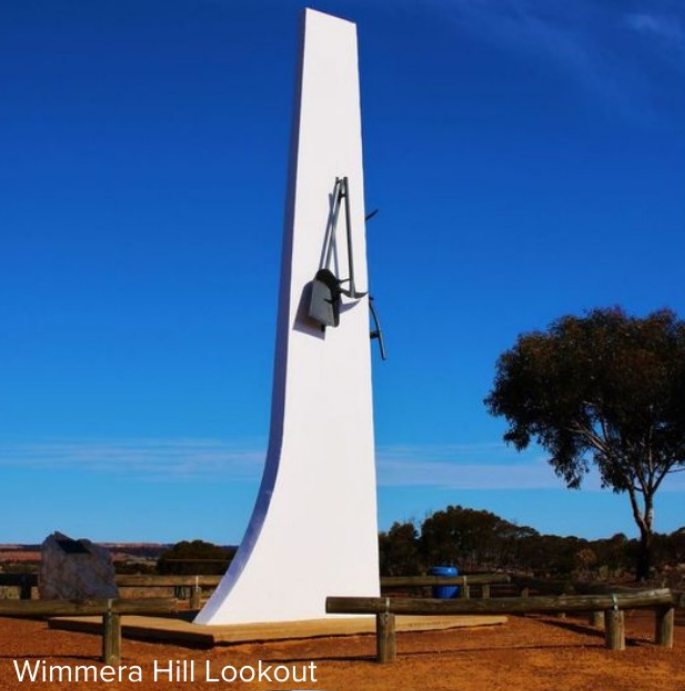
Wimmera Hill Lookout