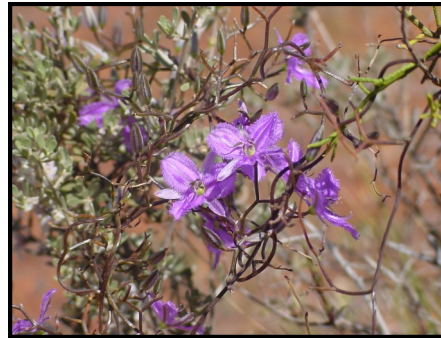
Climbing Fringe Lilly