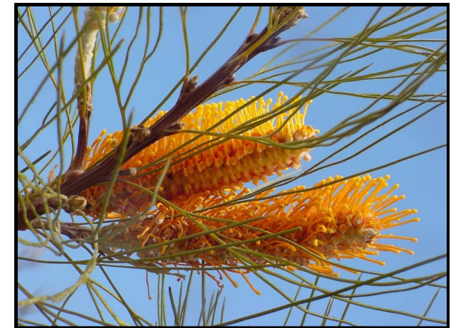
Grevillea Excelsior - The Flame Grevillea, the Shire of Yilgarn Floral Emblem