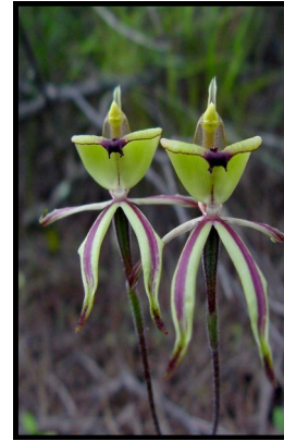
Jack in the Box Orchid