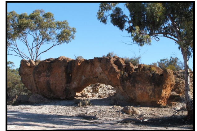
Halfway Rocks Natural arch