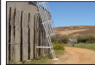
Dulyalbin Rock and tank

Look out while driving on this access road to the rock for flocks of our Red/Black tailed cockatoos (territorial birds and one of the few flocks found in the Yilgarn district).